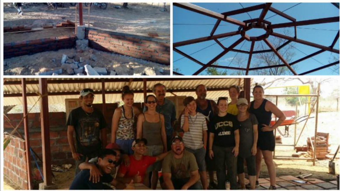
Our Colorado Partners working hard on the Learning Center.

We are excited to watch the Learning Center become a place of growth for local growers! For more information on how to continue supporting this groundbreaking work and to see the finished center, click here!