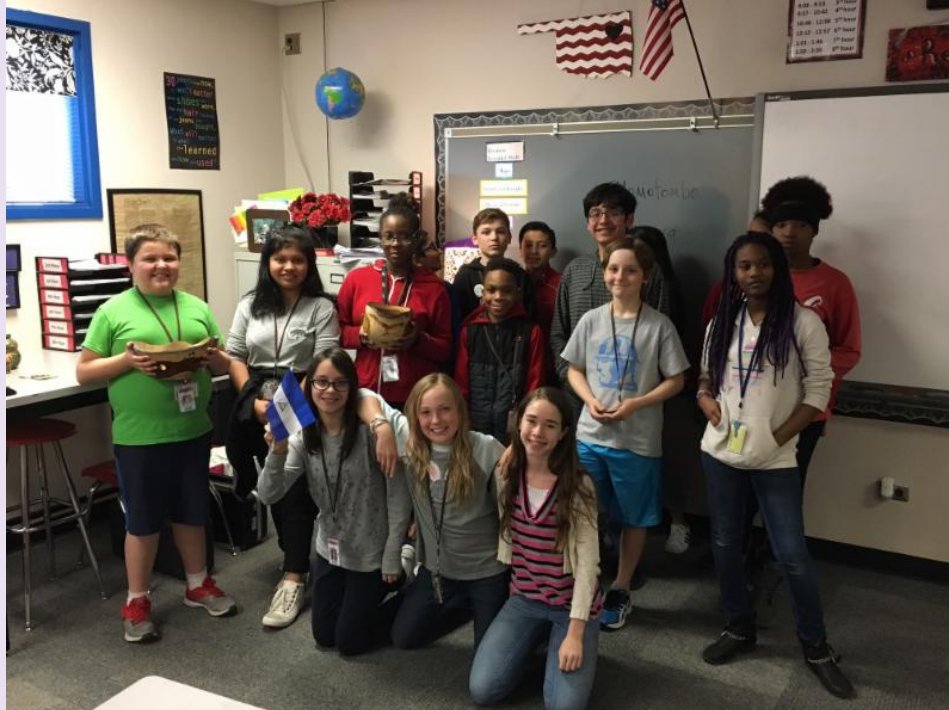
Presenting on Nicaragua at Union 6th & 7th Grade Center